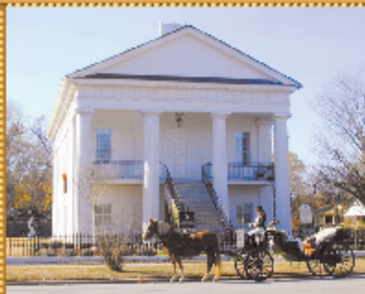
Historic Robert Mills Courthouse 607 Broad Street, Camden, S.C. 29020