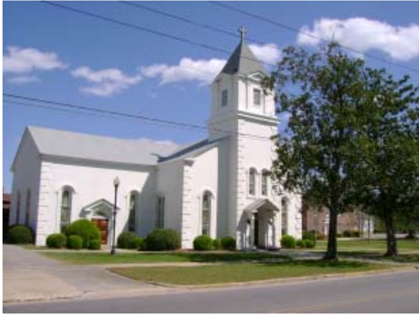
Lytleton Street United Methodist Church